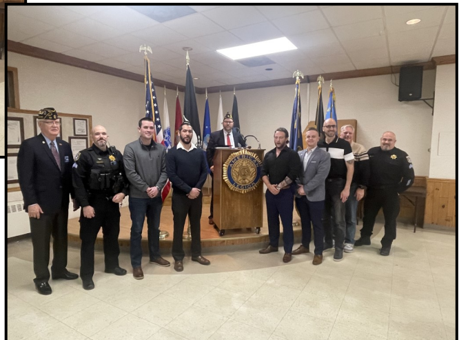
2nd Annual First Responders Dinner