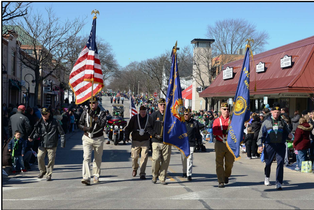
Post 43 and Post 3873 Combined Color Guard in Naperville's St. Patrick's Day Parade on March 10th.

American Legion Post #43 PO Box 4, Naperville, IL 60566