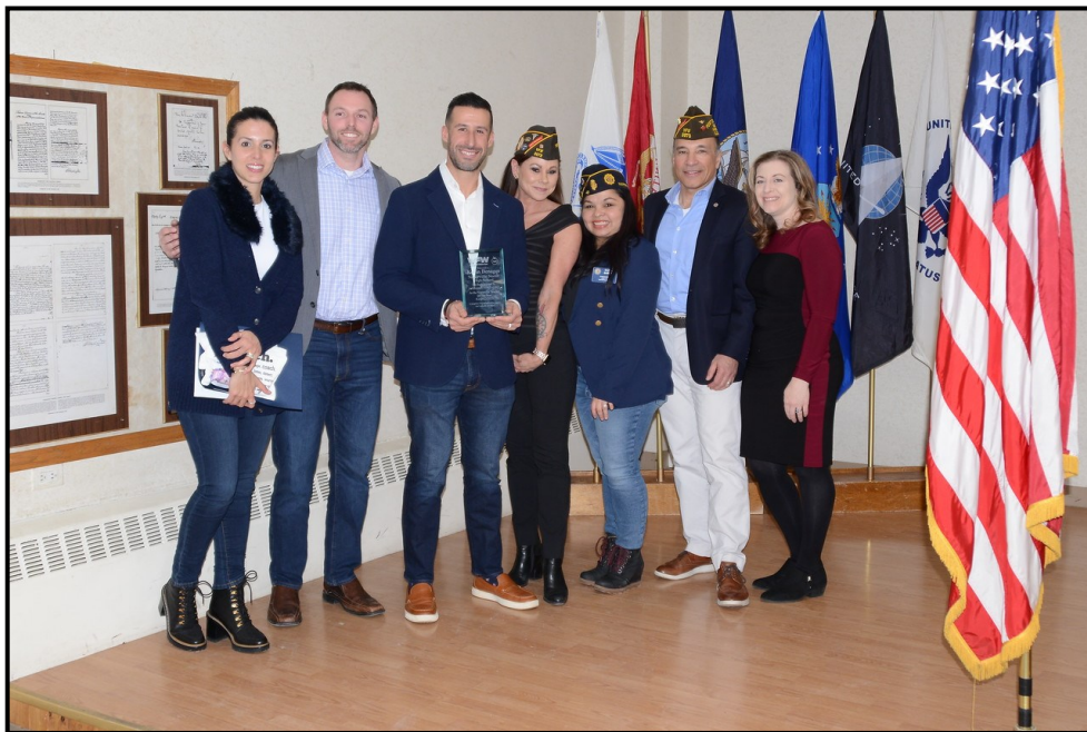
2nd Annual Dinner Honoring Naperville Educators

American Legion Post #43 PO Box 4, Naperville, IL 60566