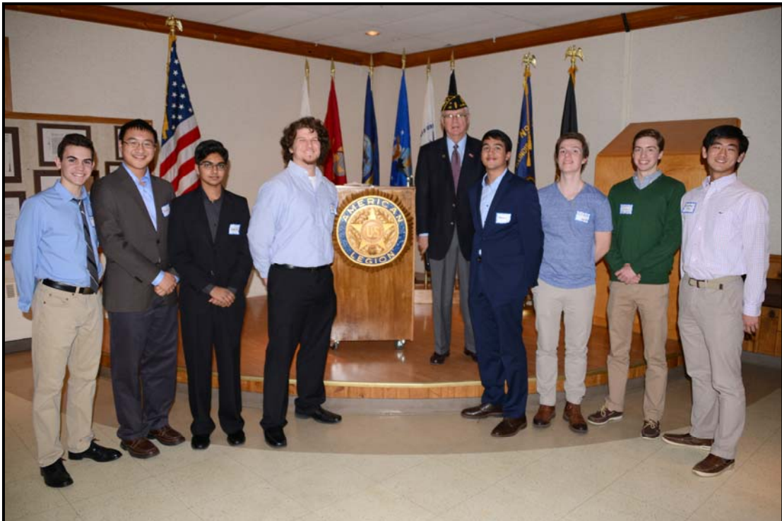
Post 43 Boys State participants at February Social

American Legion Post #43 PO Box 4, Naperville, IL 60566