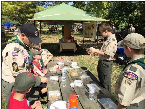
Von Oven Open House

Troop 106 has had an extremely active August/September/October. August included a weekend canoe trip. Patrol games and a troop BBQ held at VFW Park, and earning the Solar Eclipse Patch. September, with the beginning of the first month of school, had a Platoon Leader Council Planning Campout at Warren Dunes, Order of the Arrow Fall Fellowship at Camp Big Timber, Troop campout at Warren Dunes, and hosting an Open House for new scouts at Von Oven Scout Reservation. Additionally, the Troop had an excellent representation at the 9/11 Memorial Service held at the 9/11 Memorial by city hall.